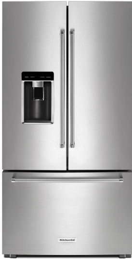
Stainless Steel with PrintShield™ Finish KRFC704FPS